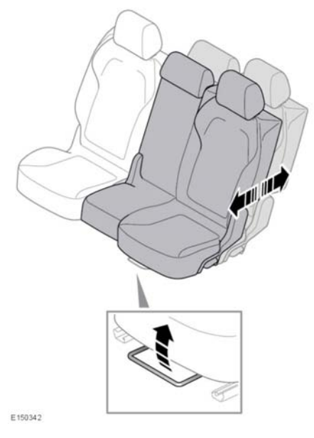
Forward and back adjustment.